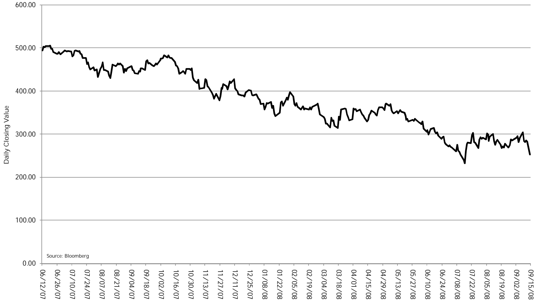
Daily Closing Value for the S&P 500 Financials Index 6/12/07 - 9/15/08 (Class Period)